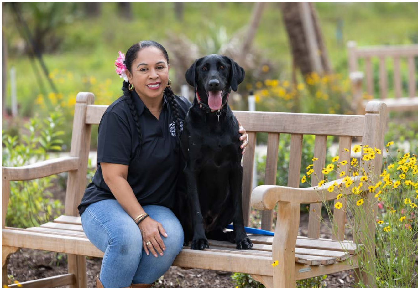
Pups4Patriots pair Rose and Tiny Tim