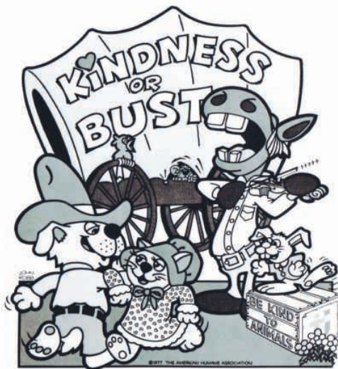
The American Humane Association Denver, Colorado 80201