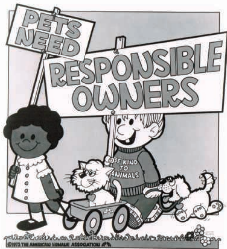
The American Humane Association Denver, Colorado 80201